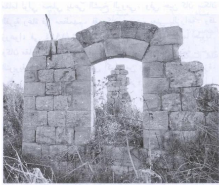
بقايا مدخل مقنطر لأحد منازل القرية (خريف سنة ١٩٨٧) [القديرية]