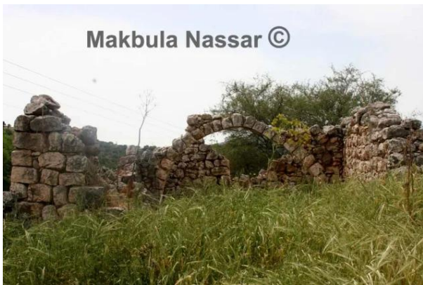
Makbula Nassar ©